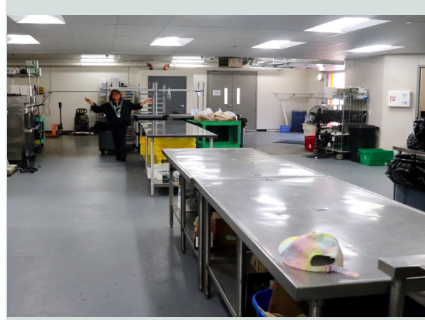
Additional Food Storage