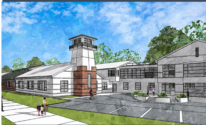
Returning the Lighthouse to Welcome Guests