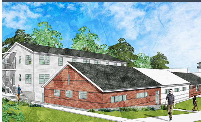
Increased Shelter & Dining Hall Space