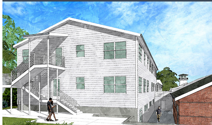
Expanded New Life Program Dorm

Connected to our Men's Shelter is our public dining room and kitchen, which we call the Good Neighbor Cafe. It serves over 800 meals a day and 300,000 meals a year to men, women and children in desperate need. With this expansion, we'll be able to feed more people safely and efficiently.