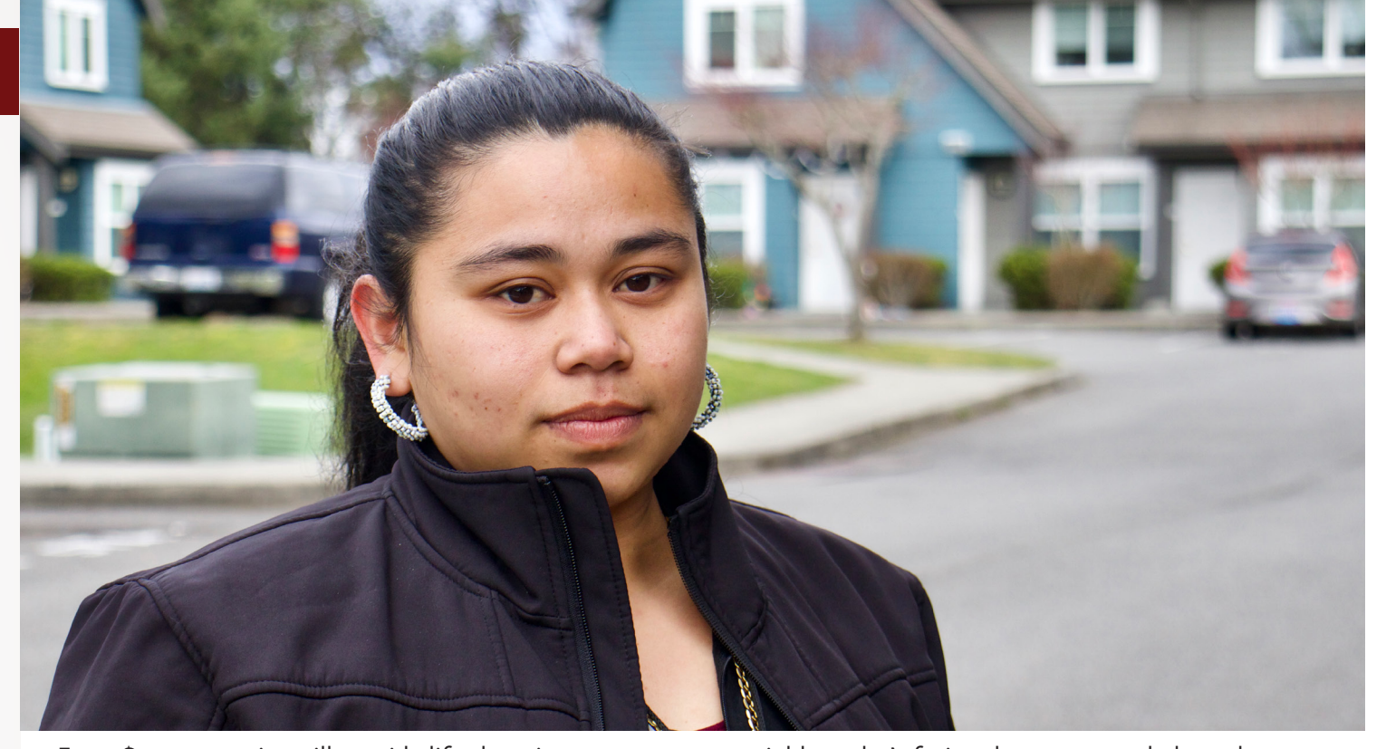
Every $19.91 you give will provide life-changing resources to a neighbor who's facing the unexpected - homelessness.

If you missed the powerful stories shared during the fundraiser, you can still watch them at trm.org/HopeGivers.