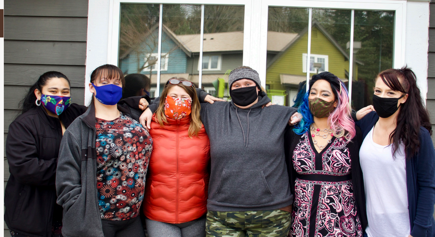
Each $32.73 you give provides a day of holistic care and healing for someone who’s desperate to step into a new life.