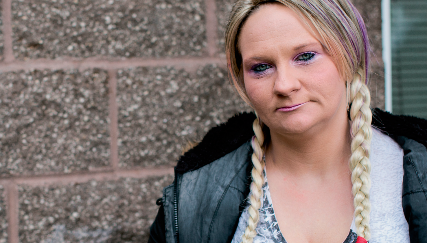
Your Easter gift today will help a neighbor who's hurting escape the streets and step into a new life!