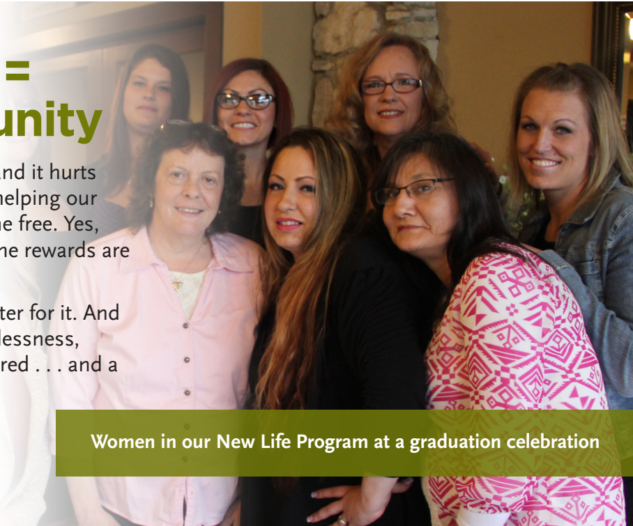
Women in our New Life Program at a graduation celebration

Addiction is expensive. It destroys lives, families and it hurts communities. That's why we're so committed to helping our homeless neighbors restore their lives and become free. Yes, it's hard work. And yes it comes with a cost. But the rewards are priceless. Every time a life is restored, our community is better for it. And whenever a community commits to ending homelessness, individuals are healed, lives and families are restored . . . and a positive cycle is put in motion. Thank you, Tacoma, for helping restore people one life at a time!