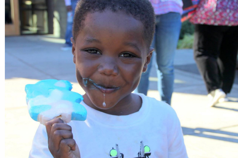
A child at our Adams St. Family Campus enjoying ice cream on a warm day.