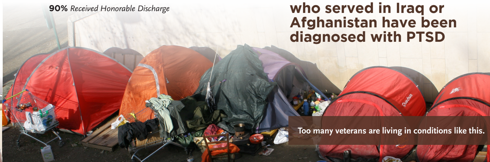
Too many veterans are living in conditions like this.

63% of male homeless veterans who served in Iraq or Afghanistan have been diagnosed with PTSD